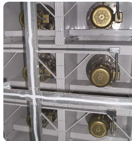
Because of its direct-drive design and smaller fan diameters, the FANWALL has a lower acoustic impact, especially in the lower frequencies, which are more difficult to attenuate.