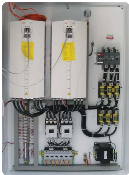
The unit control panel includes redundant variable-frequency drives for the fan motors. This ensures heightened system reliability. The panel also includes circuit protection equipment and system interfaces with building automation systems using standard protocols.

In the case of Our Children's House, the revised air handler has a FANWALL array with six individual fans, two wide and stacked three high. One of the six fans is held in standby, with a damper system to prevent backflow. Eversole points out that the system can meet the specified airflow with only four of the fans operating and, in the worst case, could